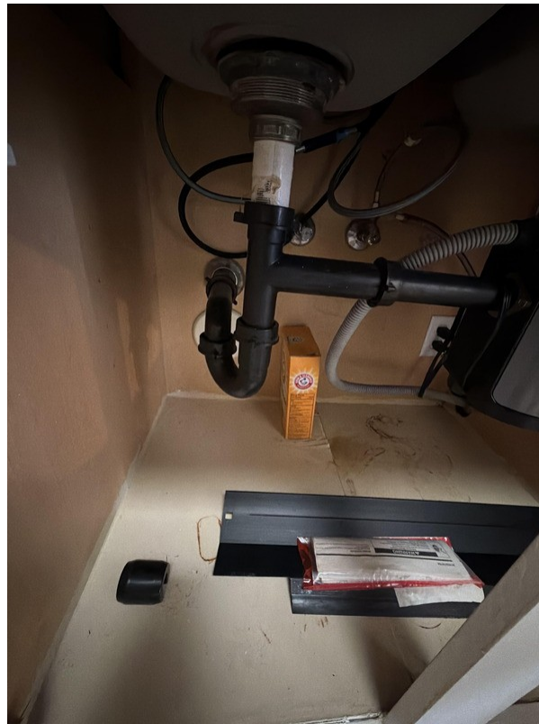
⚠ Under-sink — sprayer hose loose