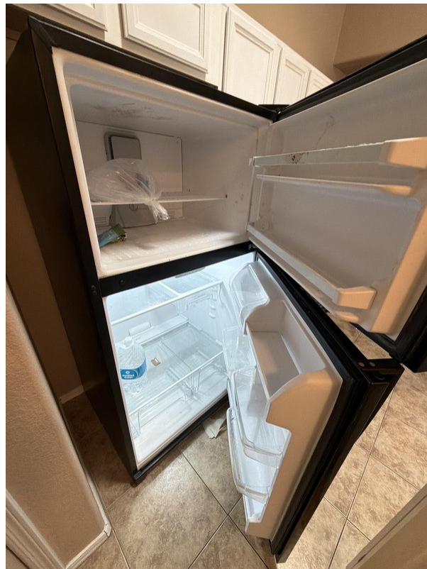
⚠ Refrigerator — interior cleaning required