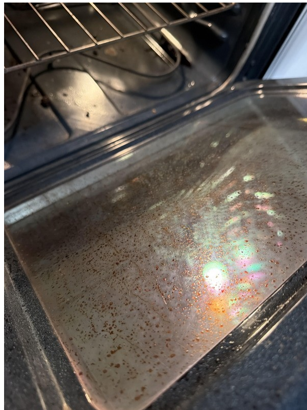
⚠ Stovetop — cleaning required