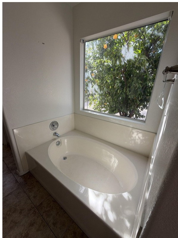
Primary bath — soaking tub