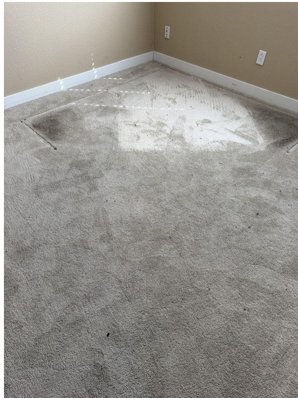
⚠ Bedroom #3 carpet — professional cleaning required