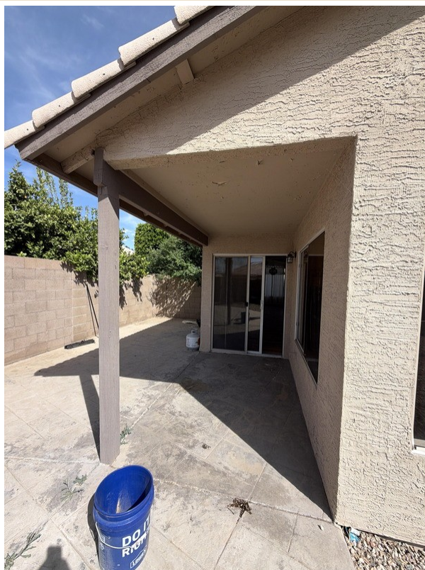
⚠️ Patio / slider area — debris