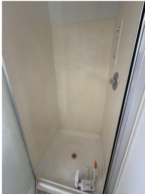
Primary bath — glass shower enclosure