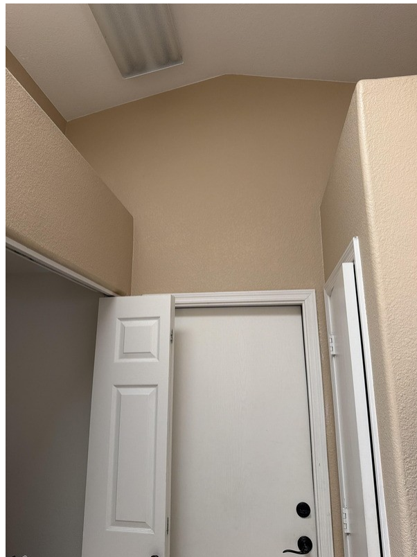
⚠ Hall to garage — CO detector MISSING