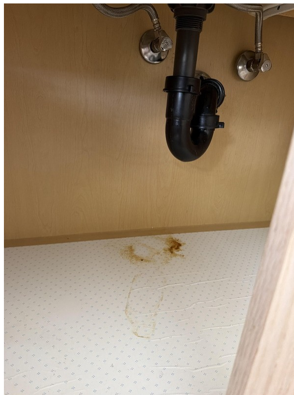
⚠️ Primary bath toilet area — slightly wobbling