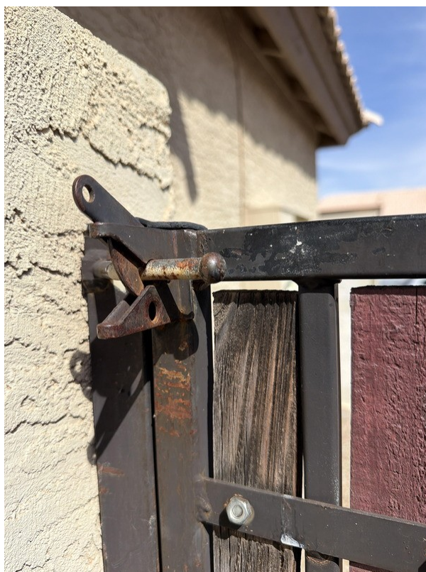
⚠️ Front gate latch — stiff