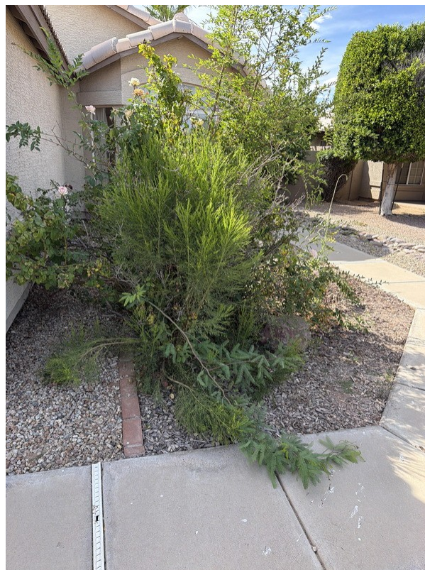
⚠️ Front yard — overgrown landscaping