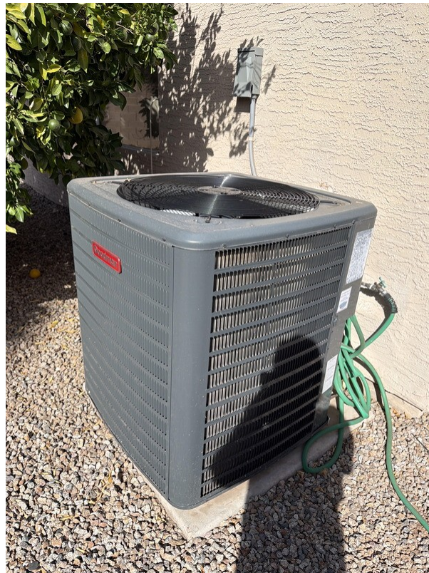
HVAC condenser — exterior