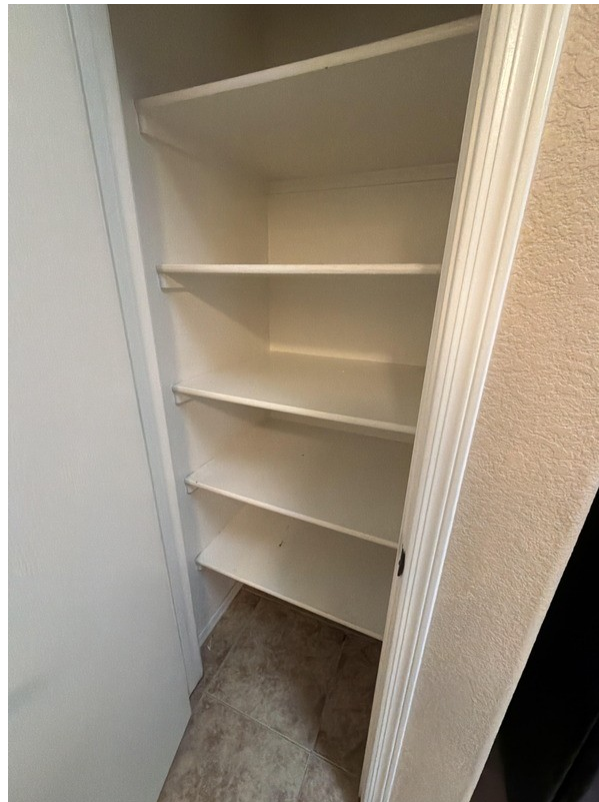
⚠️ Pantry — cleaning required