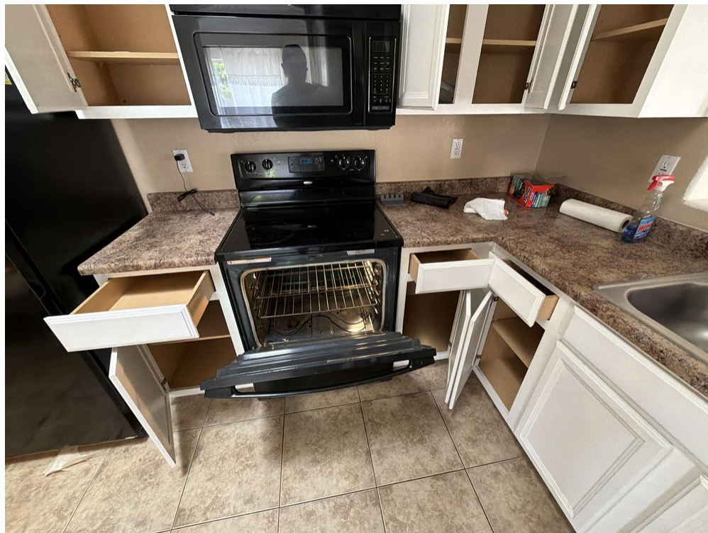
Kitchen overview — peninsula