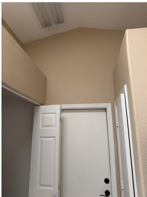
⚠ Hall to garage — CO detector MISSING (must install)