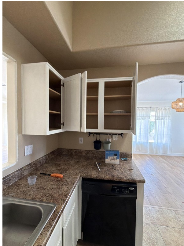
⚠ Kitchen cabinets — open, cleaning required