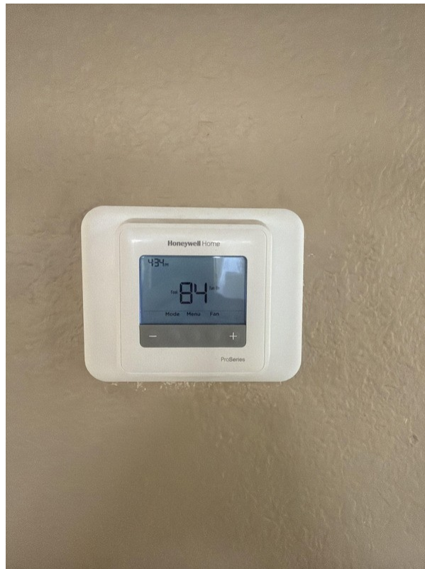
Thermostat — functional